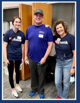
Volunteers from US Bank during the Karlins move.

Volunteers from US Bank helped us make the move to OP-Karlins Center's new location last summer. They moved furniture, set up classrooms and made sure everything was