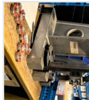
Stanley pressing cams and bearings during a day at work at Pumptec.

To hire workers through Opportunity Partners, learn more at opportunities.org/businesses/hire-us/