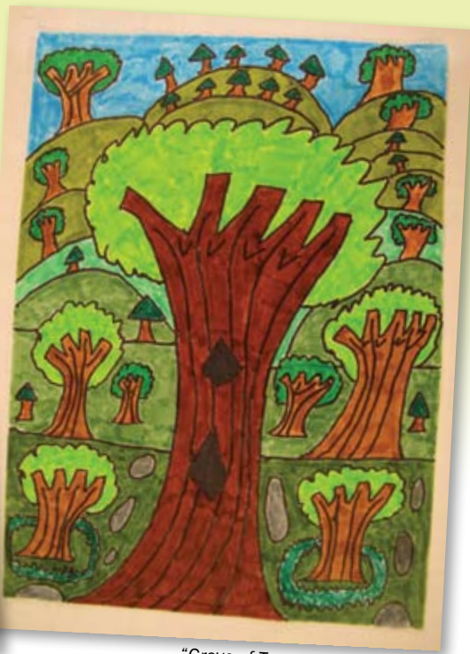
"Grove of Trees" by Allan Benson